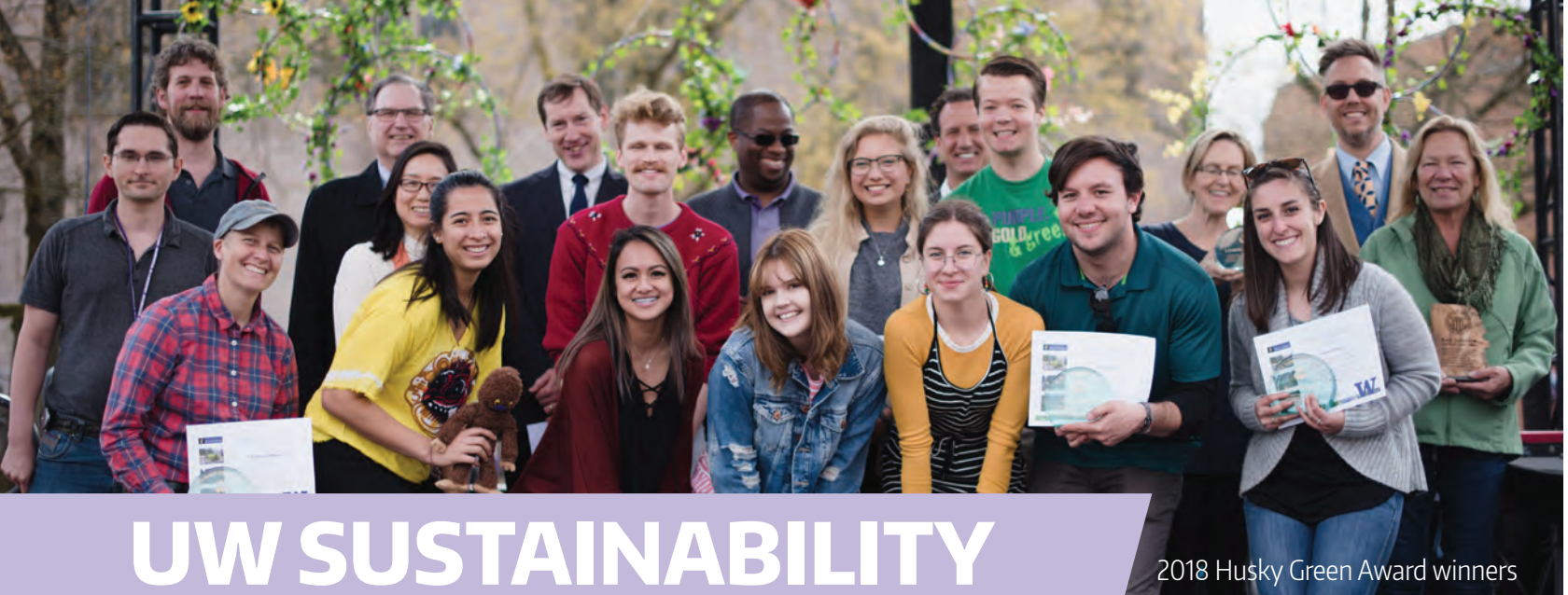
2018 Husky Green Award winners